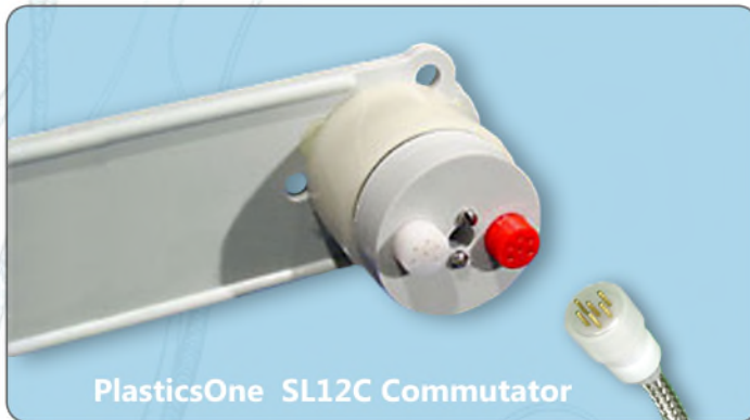
PlasticsOne SL12C Commutator