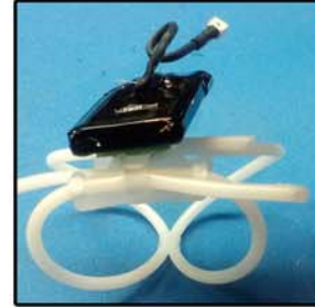
Rat Saddle Harness with Attached External Battery