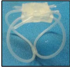
Mouse saddle Harness

The TBSI Saddle Harness is intended for use on a mouse (004-0001-10), rat (004-0001-20) or species of similar size. Each is equipped with a silicone base and Velcro secured to the top for easy attachment and removal of external (non-head mounted) TBSI headstage components and/or battery.