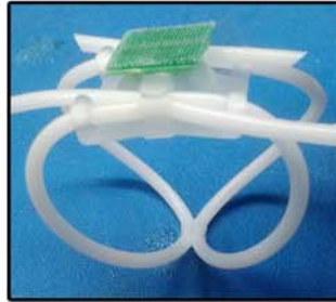
Rat saddle Harness