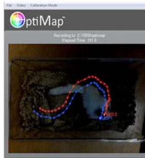
OptiMap™ Video Tracking Software